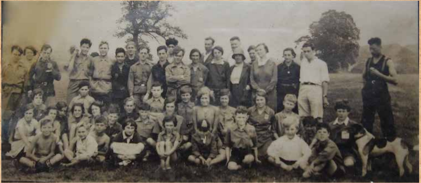
HARROW WOODCRAFT FOLK "LONE PINE FELLOWSHIP" 1935 (BADGER AND HEATHER CENTRE BACK)

The first group in Harrow was started in the old Co-op Hall in Kenton on February 7th 1932. This group was called the Pathfinders Fellowship. Soon after the formation of this first group, a leaders training group started in the Wealdstone Co-op Hall, Masons Avenue. The group was called the, "William Morris Lodge."